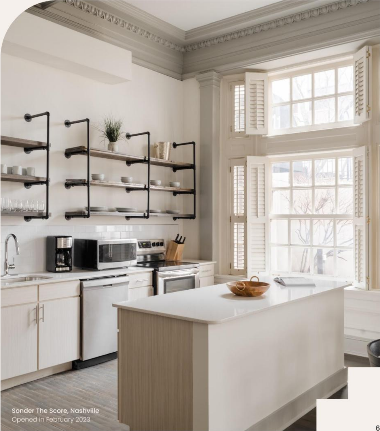
Sonder The Score, Nashville Opened in February 2023