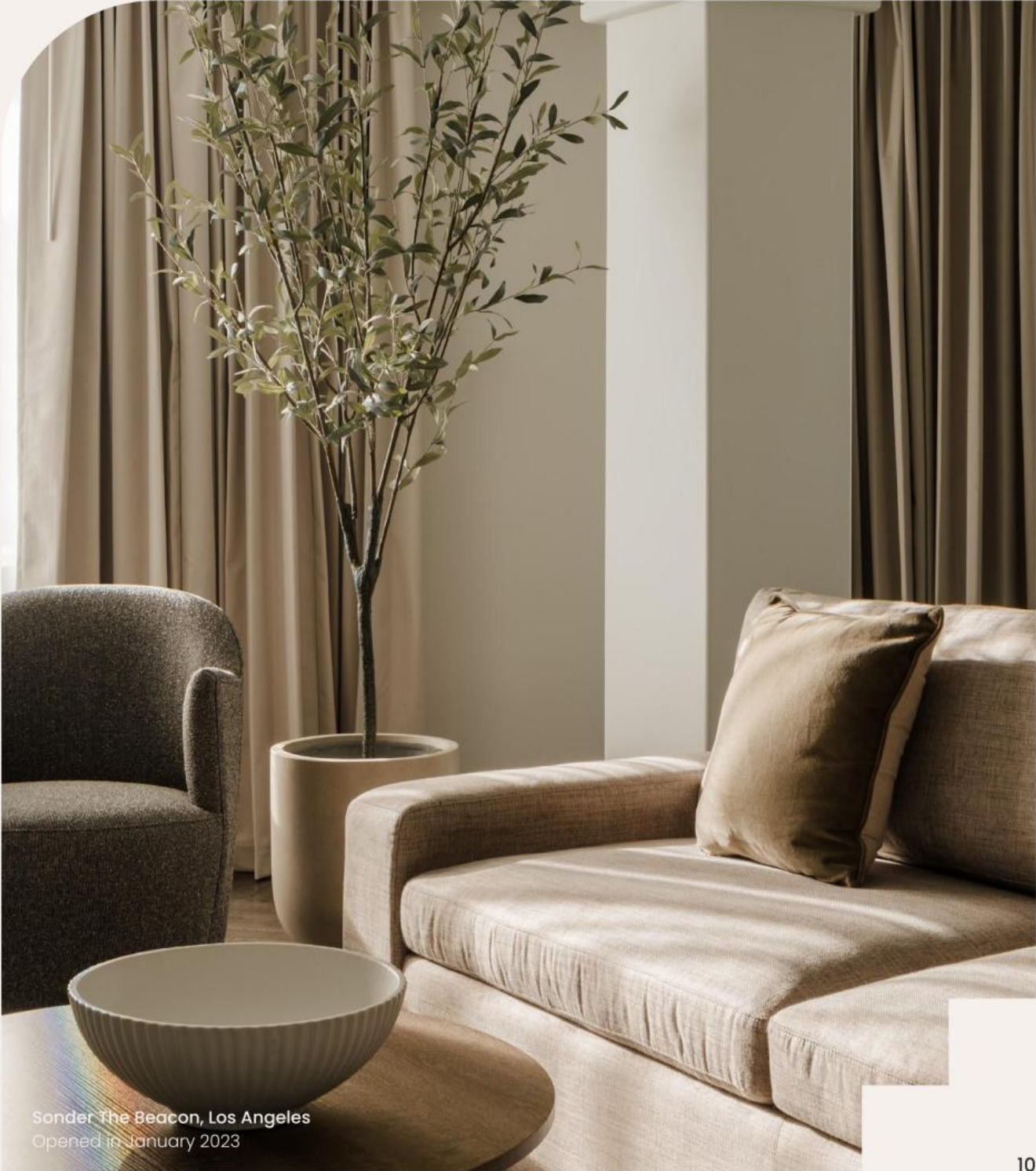
Sonder The Beacon, Los Angeles Opened in January 2023